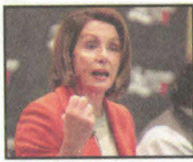
Nancy Pelosi (32 yrs.)