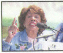
Maxine Waters (28 yrs.)